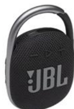
JBL Bluetooth Speaker