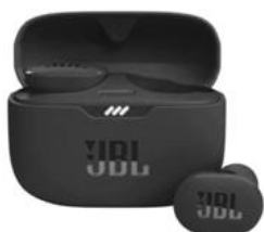
JBL Bluetooth Headphones