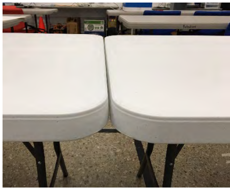
a) table joint with gap