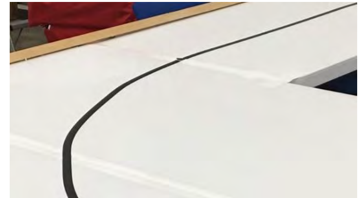
d) Finished connections with 2" tape and black line from electrical tape