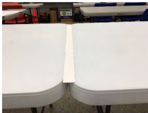
b) with poster paper filler (~1" wide)