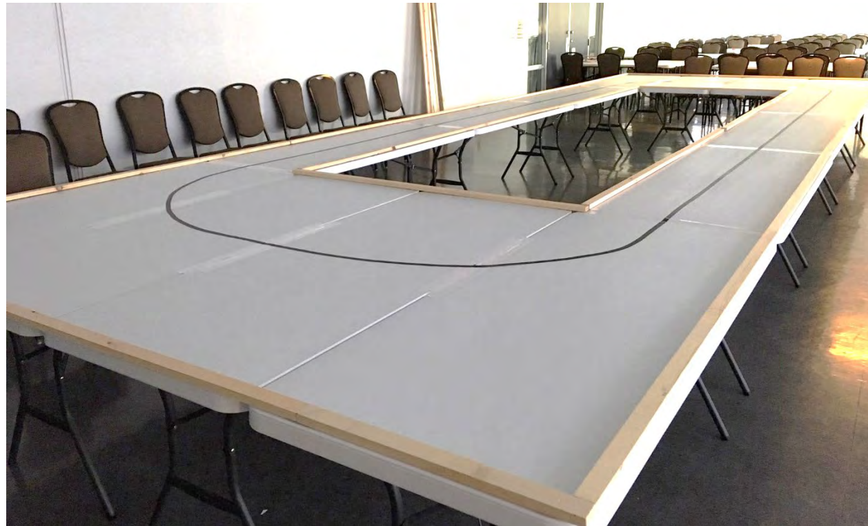
2019 World Championship course with 2x2 retaining walls