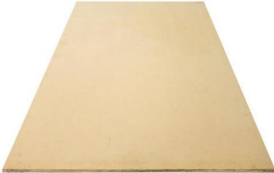
¼" 4ft x 8ft MDF sheet