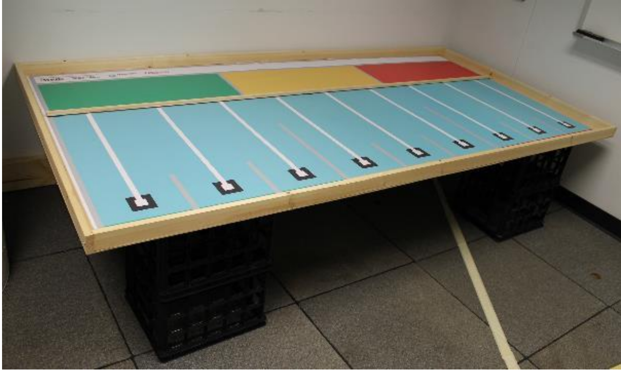
WRO 2015 regular Junior Table