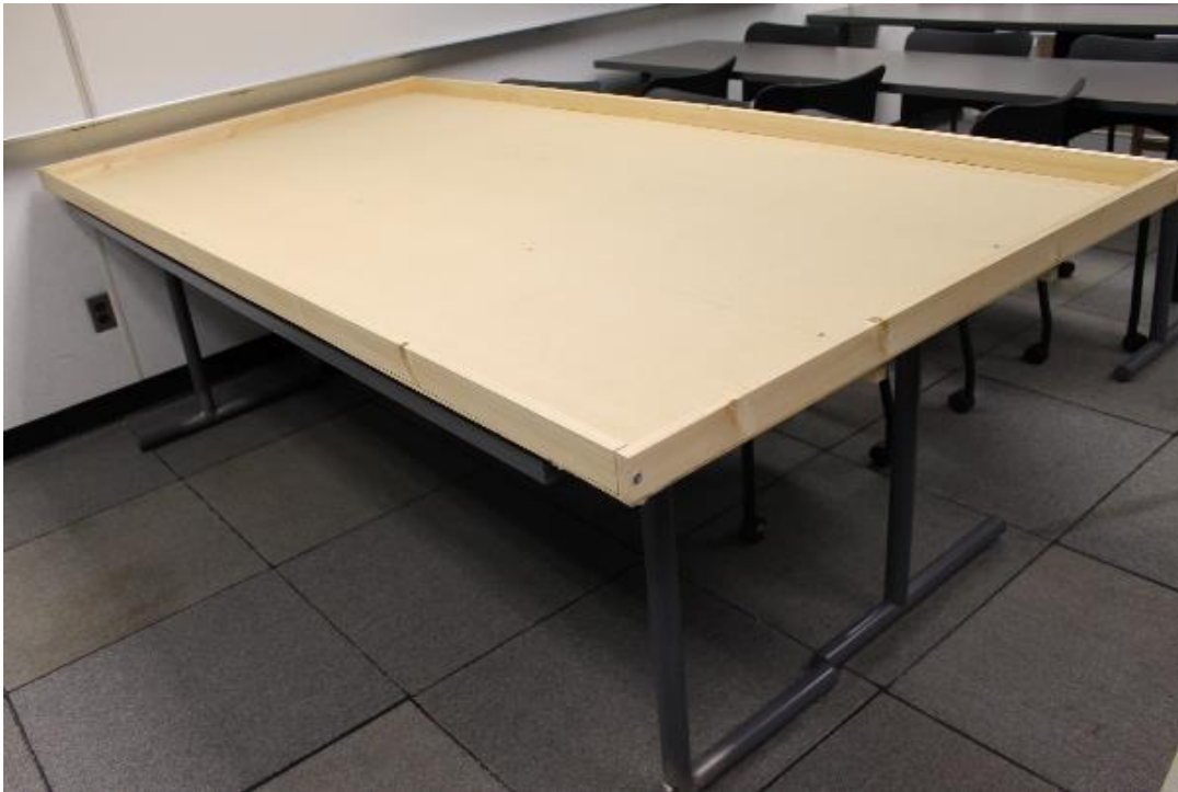
Can be placed on tables