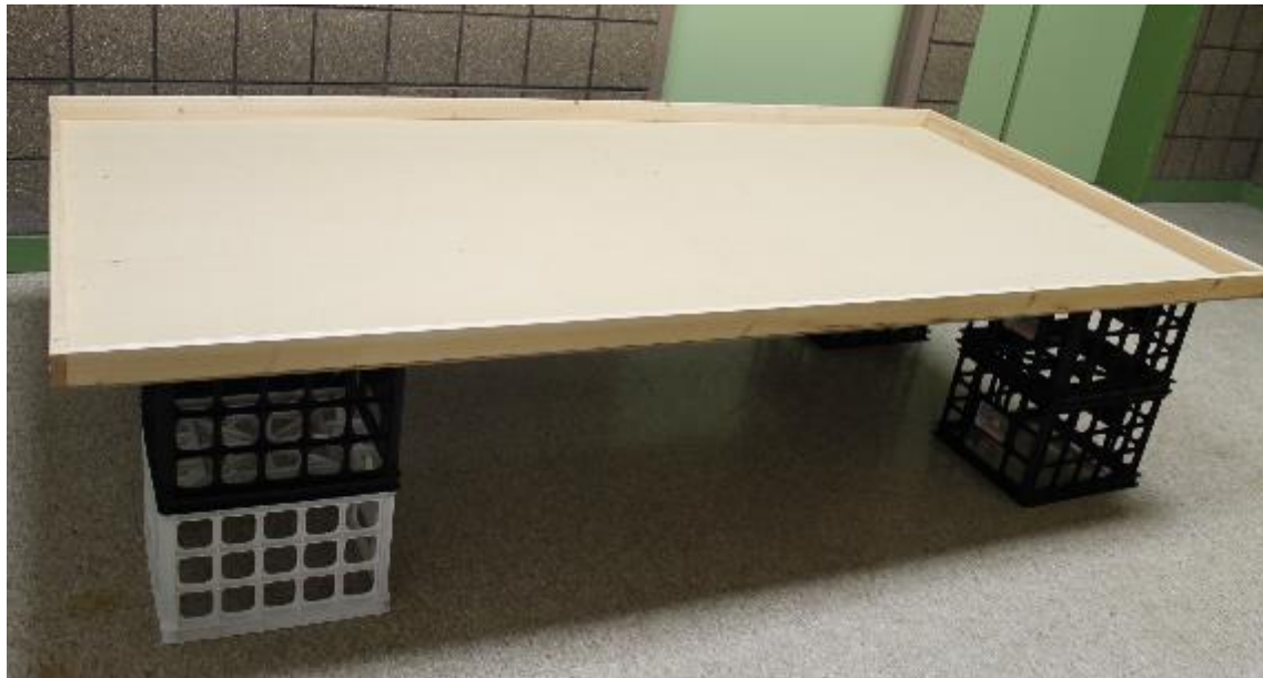
Can be placed on 8 crates (Good for young children to access. Spectators can also see better)