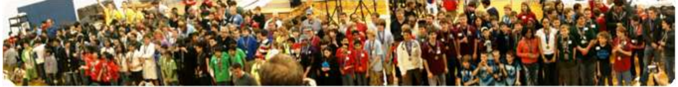
12 th Annual World Robofest Championship, May 7, 2011, Southfield, Michigan